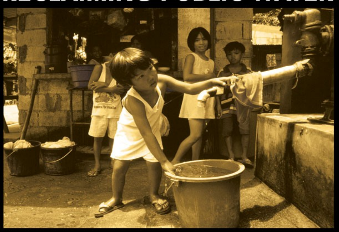
Achievements, struggles and visions from around the world